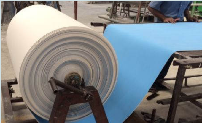
Foundation Cloth for Carding Industry