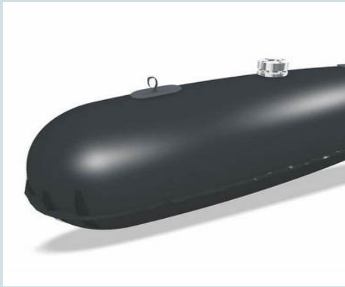
Air Cell for Transformer Industry