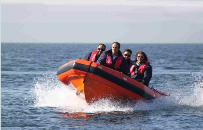
Rubber Inflatable Boat