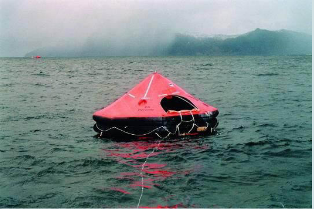
Rubber Inflatable Life Rafts