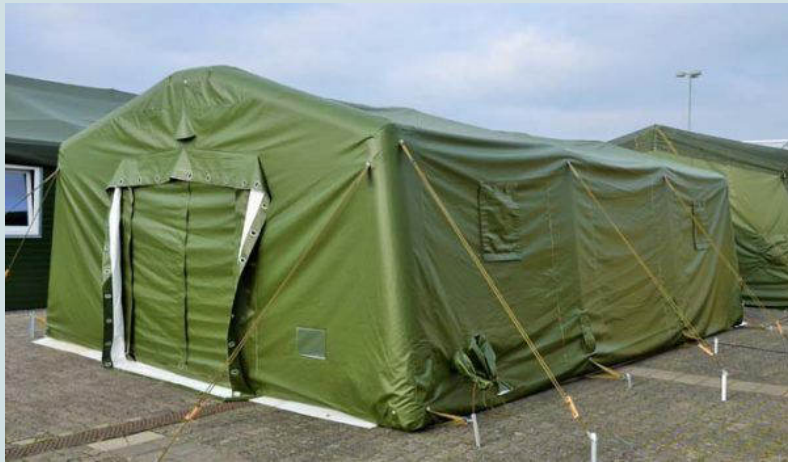
Quick collapsible Inflatable Tents