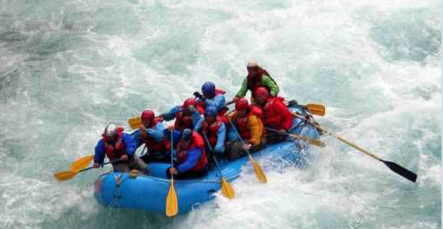
Rubber Inflatable River Rafts