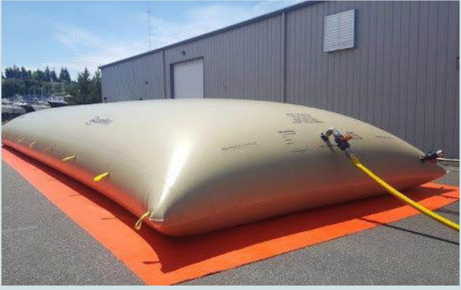
Collapsible Water Storage Tanks