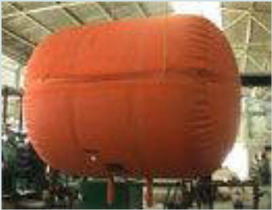
Gas Holder Balloons